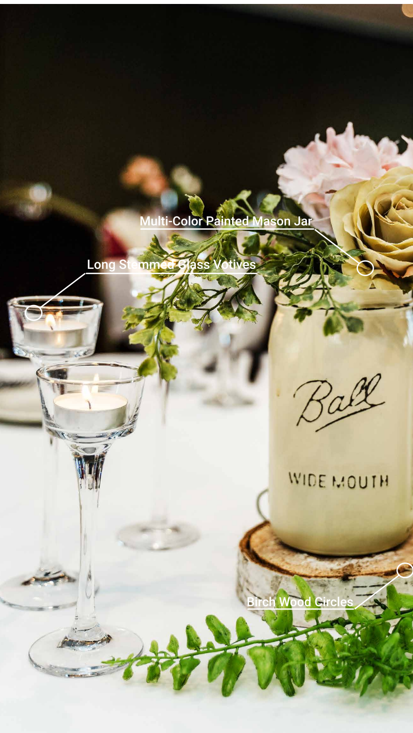
Multi-Color Painted Mason Jar