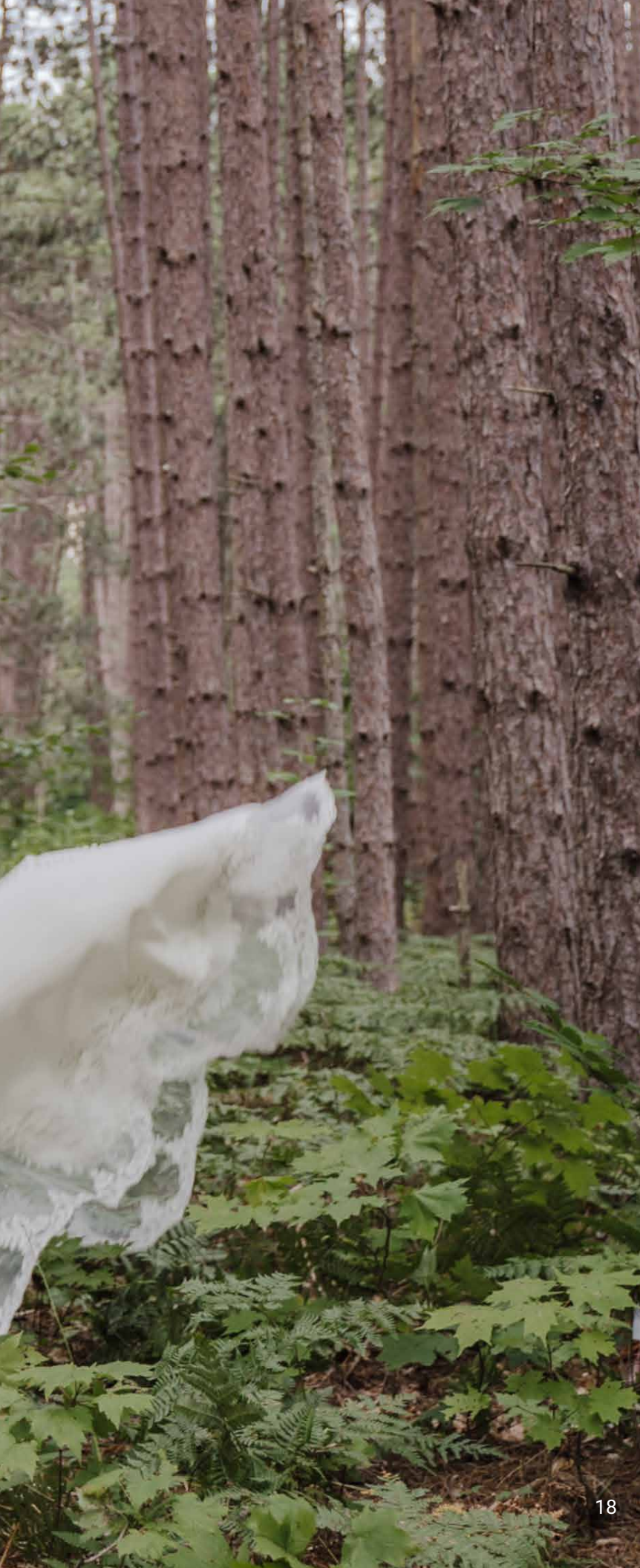
PHOTO BOOTH COMPANIES